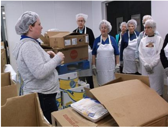
Second Harvest Foodbank Service Project