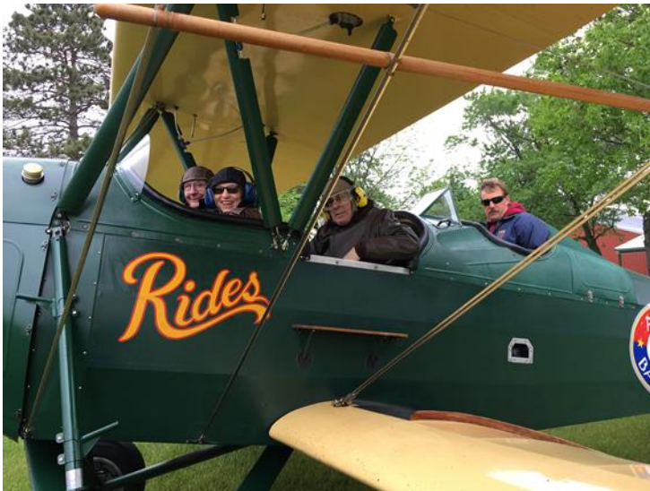
Brodhead Airport Vintage Aircraft WWI and WWII