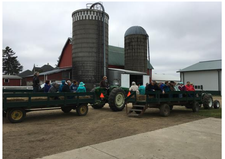
Hinchley Dairy Farm Tour of Crops