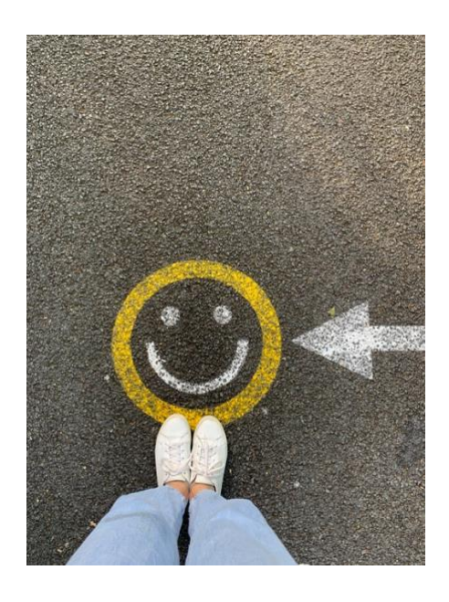
Explore • Understand • Serve®