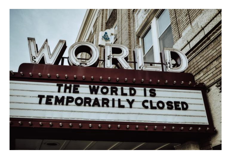
The key word is "temporary."

My husband purchased a world map and then gave me a dart and said, "Throw this and wherever it lands—that's where I'm taking you when this pandemic ends." Turns out, we're spending two weeks behind the fridge.