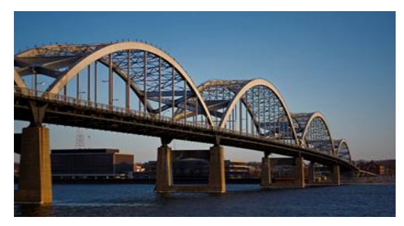
Midwest – Great Lakes Regional Conference Building Bridges with Friendship April 28-May 1, 2016, Davenport, IA

Look for registration details in January