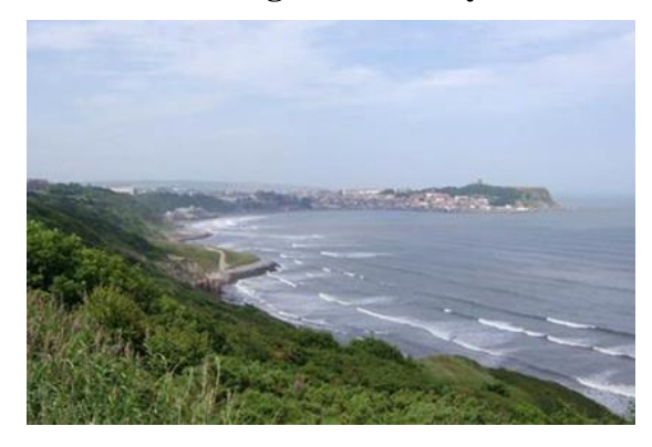
Scarborough to Filey Along the Cleveland Way

2016 Outbound Exchange Cleveland County, UK, May 10-17 Post Exchange Tour: May 18-21