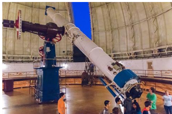
Yerkes Observatory – Williams Bay

SAVE the DATE. Join us for a spring adventure.