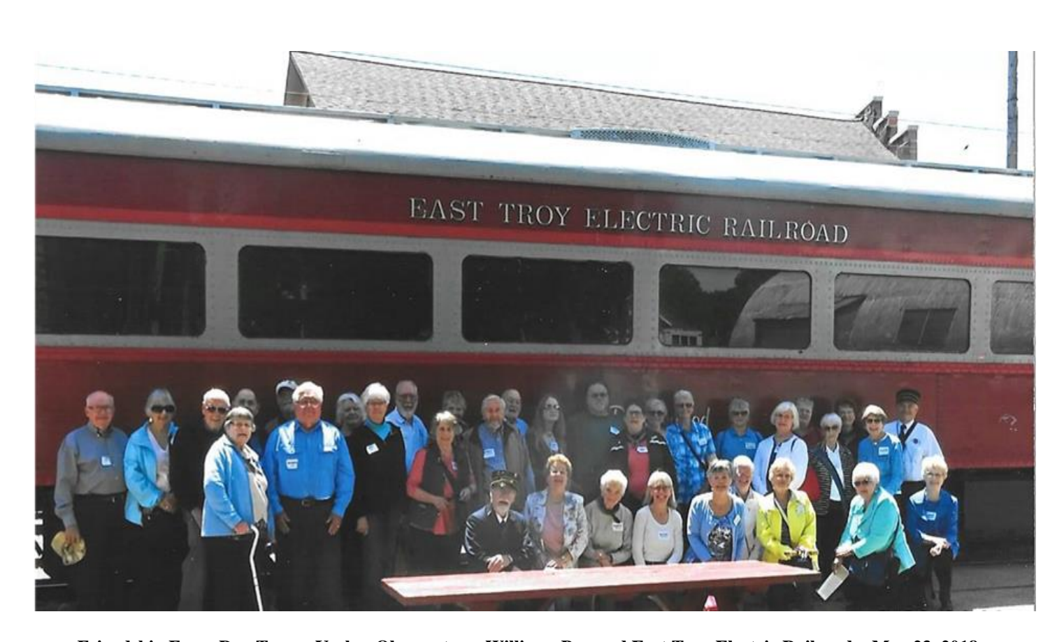
Friendship Force Day Tour - Yerkes Observatory, Williams Bay and East Troy Electric Railroad - May 23, 2018

ffwis.general@gmail.com ffwis.meeting@gmail.com ffwis.membership@gmail.com ffwis.outreach@gmail.com