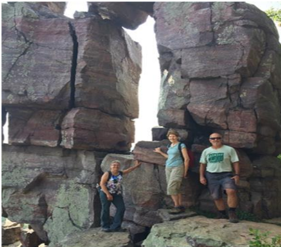
August Hike-Devils Lake State Parke at "Devil's Doorway"