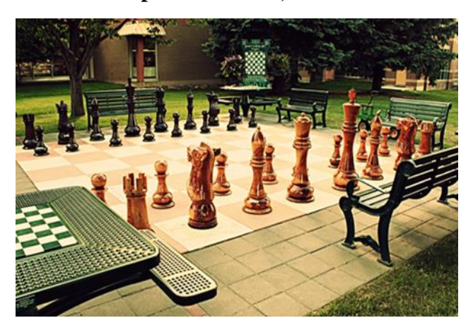
World's Largest Chess Set

Good news! Four of our club's members will be going to Medicine Hat joining a group of 12 ambassadors from Fukuoka Japan. According to the draft itinerary sent by Medicine hat, the ambassadors of both clubs will spend time in the city's historic centre home to the world's largest chess set weighing in at 870 pounds and also includes the Stations of the Cross, St Pat's Church, Veteran's Memorial Park, Esplanade, and Courthouse, visit Medalta Potteries, the Saamis Teepee and some of their regional and interprovincial parks, learn about their greenhouse industry and the Fieldberg farm hemp operation, and tour Medicine Hat College. In addition to the welcome and farewell dinners, two of the other evening meals include dancing, one of which is country line dancing.