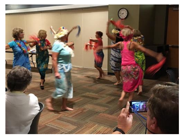
Farewell Party Goodman Community Center

We had many interesting activities and educational experiences for 16 (four couples, seven women and one male) ambassadors from the Nouméa, New Caledonia Club. Plus there were four American ambassadors who joined them, one couple and two women. We had our traditional Friday night fish fry, visit to Hinchley Dairy Farm and tour of the State Capitol with free time to wonder around downtown Madison. We explored the University of Wisconsin campus and enjoyed the Memorial Union Terrace. We took wonderful boat tours on the Mississippi, Wisconsin Dells, as well as, optional pontoon boats around Madison. We visited the National Mississippi River Museum and Aquarium in Dubuque, Iowa and the continually evolving International Crane Foundation. Dinner highlights included a Table Top Spaghetti Dinner, a singular experience, as well as small group dinners hosted by club members. culminated in an almost rain-swept farewell dinner party featuring a memorable music/dance review put on by the women from New Caledonia.