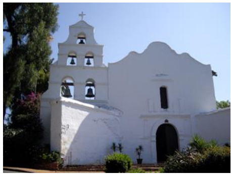
Mission San Diego de Alcalá founded in 1769