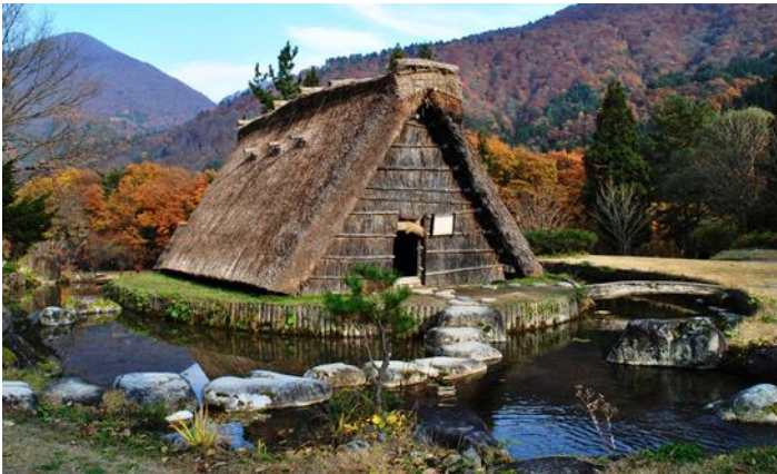
Shirakawago Mountain Village –Aichi Prefecture