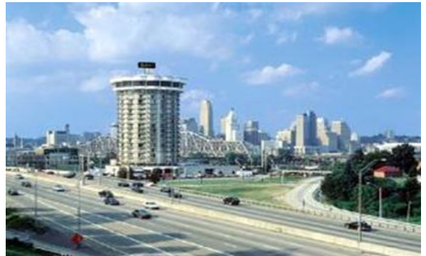
Radisson Hotel Cincinnati Riverfront 668 W. 5th Street, Covington, KY 41011