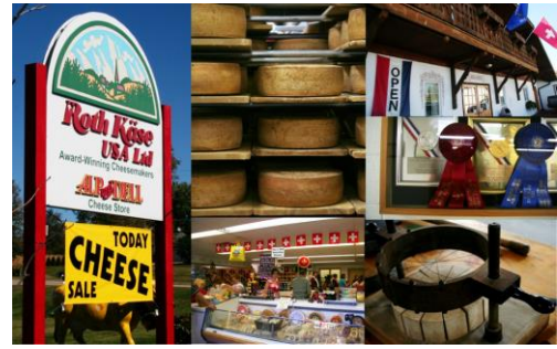
Alp & Dell Cheese, Monroe