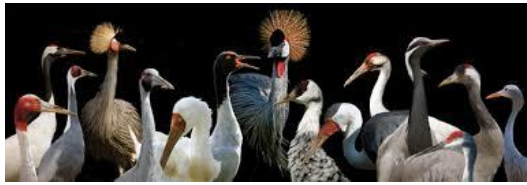
International Crane Foundation