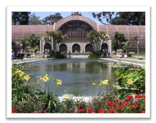
Balboa Park San Diego Outbound Exchange April 7-14, 2015

April 7 will be here in about a month and we are all very eager to escape these chilly temperatures – San Diego or bust! 19 people are participating in this exchange – 16 from our club, two from the Friendship Force of Greater Orlando and one from the Friendship Force club in Dallas, TX.