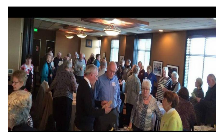
Singing "Let There Be Peace on Earth"