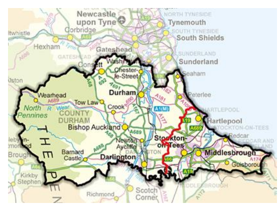
Suitcases Nearly Packed

The twelve ambassadors going to England and Scotland are leaving on various dates in May and meeting in Stockton-on-Tees on May 11 to begin our week long exchange. We are ready and eager and starting to think about what to pack.