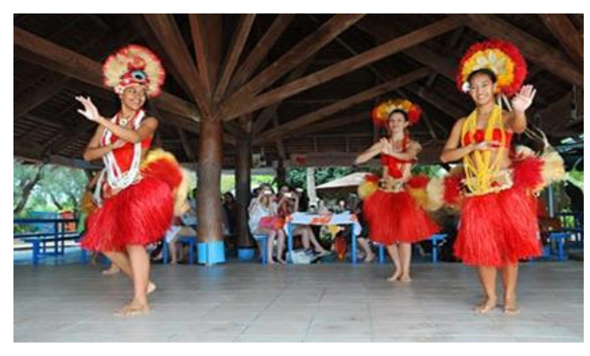
French Polynesian Dancers

The ambassadors will be here from Friday afternoon, June 23, through Thursday, June 29, 2017. So far there are 16 in their group. There is a possibility of getting four more ambassadors from other Friendship Force Clubs from around the world. We're being advertised in the Friendship Force International Catalog! We will find hosts for new ambassadors as we get them.