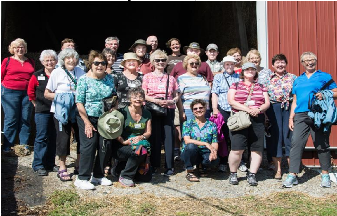
Hinchley Dairy Farm Tour