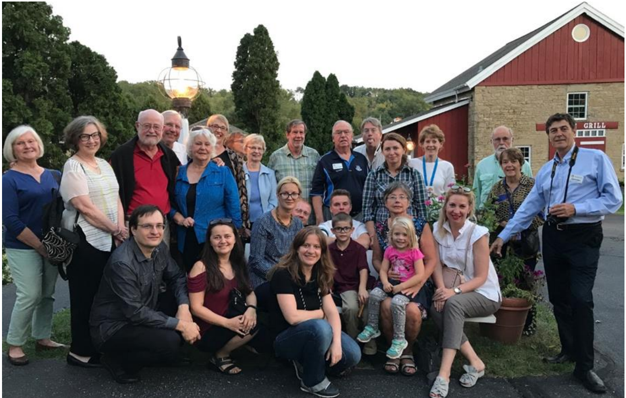
Open World Farewell Party – Quivey's Grove, Fitchburg, WI