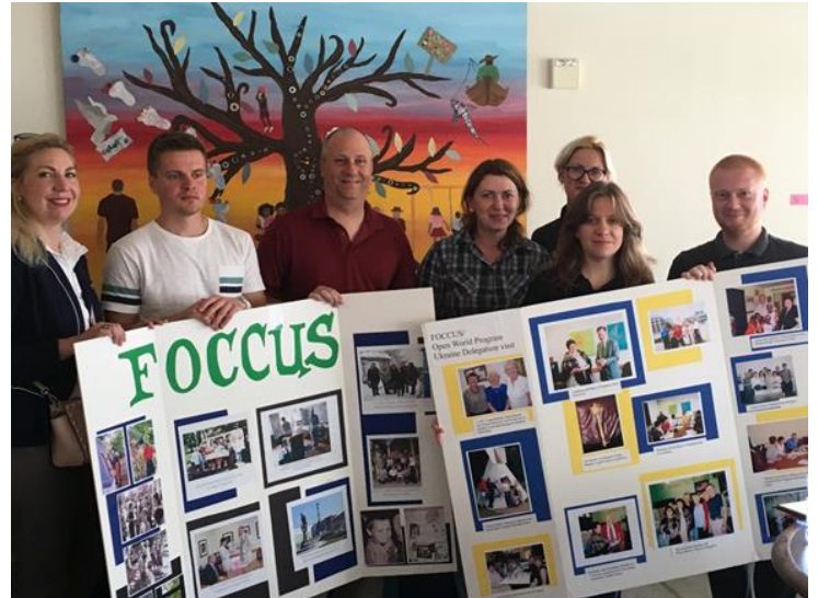
Friends of Chernobyl Centers, US