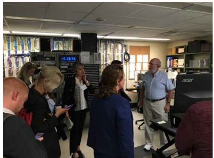
Tour of Wisconsin Public Radio