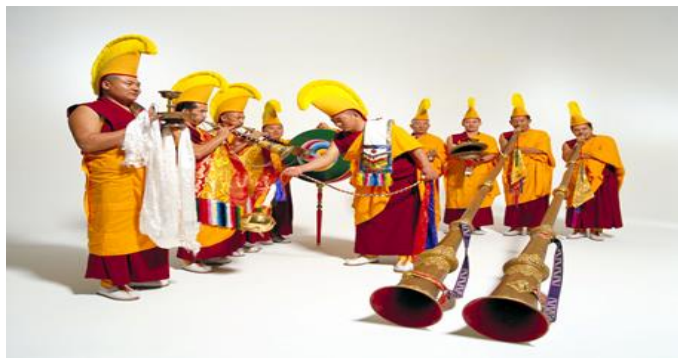
The Musical Art of Tibet

https://union.wisc.edu/events-and-activities/event-calendar/event/madison-world-music-festival-free