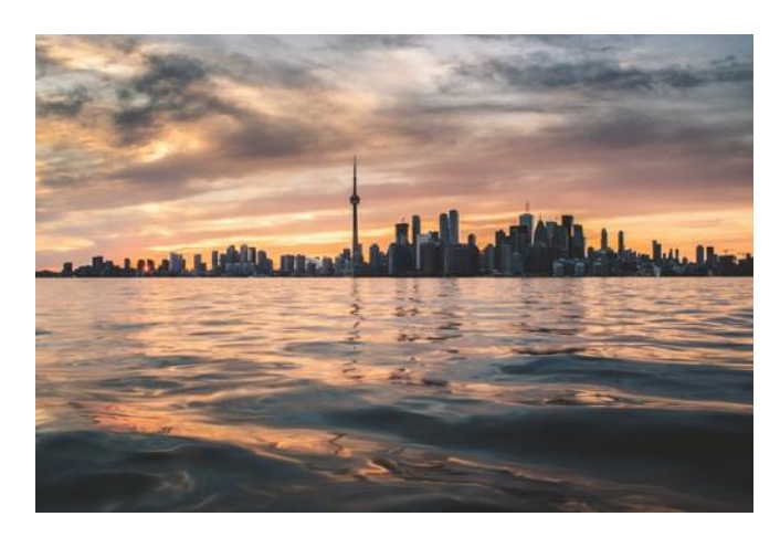
Explore • Understand • Serve •