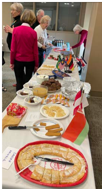
International desserts served at our Annual Meeting