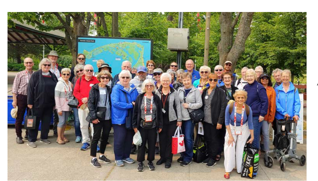
Madison-Toronto Group Photo

Other highlights during the week included the CN tower, a choice of the Art Gallery of Ontario or the Royal Ontario Museum, the St Lawrence Market, and The Distillery District where we saw the play, "Sizwe Banzi Is Dead". The plot showed the heart-wrenching situation of a black man in South Africa.