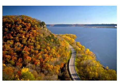
Reservation Form—DEADLINE FRIDAY, SEPTEMBER 8, 2023 LaCrosse Queen Cruise, Granddad Bluff and Historic City Tour - LaCrosse, WI, October 13, 2023