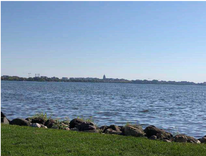
— View of Lake Mendota from Maple Bluff Beach

We will be dining from the banquet menu of the Southern BBQ Buffet. The selections are Carolina-Style BBQ, pulled pork shoulder, hickory smoked chicken, creamy coleslaw, sweet cornbread, honey butter, red beans and rice, braised green beans with bacon and onions, mac & cheese, and peach cobbler for dessert. Coffee, hot tea, and water are included.