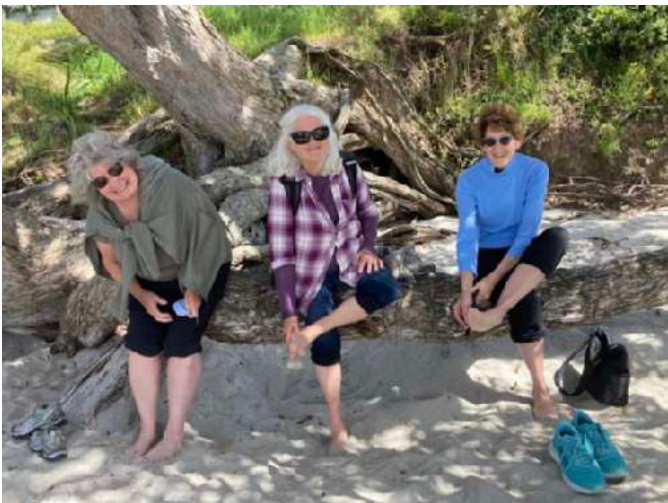
— 3 tired but happy “hobbitses” dust off their feet after a walk on the Weeping Sands of Onetangi, Waiheke Island (North Island, NZ)

The North Island journey began with ten ambassadors traveling to Auckland on the North Island after “losing” a day crossing the International Date Line. These ten super-tired people enjoyed three days in the most sophisticated part of New Zealand. They enjoyed fine dining, a ferry trip, and an on-off bus trip around Waiheke Island visiting vineyards and small artist communities much like Door County in Wisconsin. We of course made the mandatory visits to the local museums and colorful marina area.