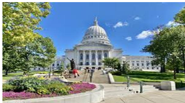
Wisconsin State Capitol – Madison, WI