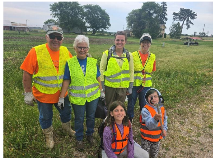
Adopt a Highway June Clean-Up Crew