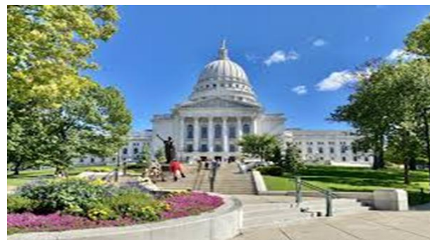
Wisconsin State Capitol – Madison, WI